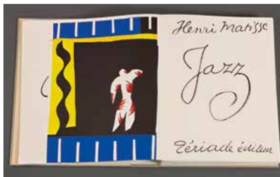
Jazz , 2004 - Facsimilé d'après l'exemplaire - n° 169 de l'édition originale du livre illustré d'Henri Matisse, Jazz , Editions Tériade, Paris, 1947 Collection-Ville de Vence - © Succession H. Matisse