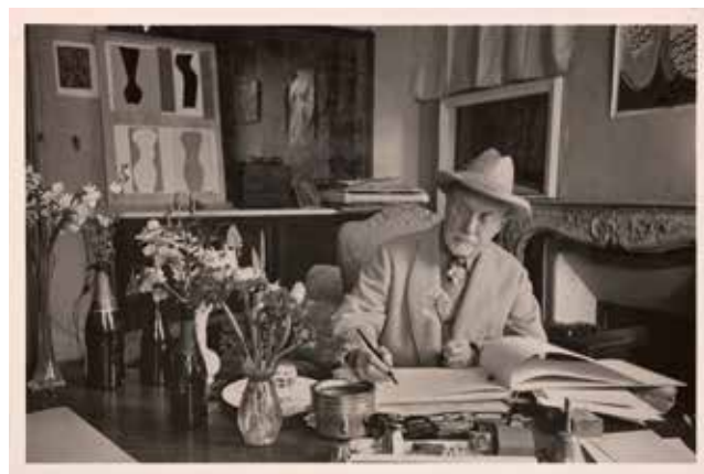
Henri Cartier-Bresson - Henri Matisse à villa le Rêve, 1944 Collection Ville de Vence