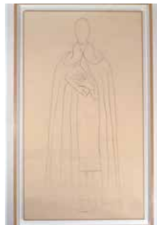
Henri Matisse - Saint Dominique, 1950 Collection Ville de Vence