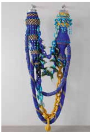
JOANA VASCONCELOS Ishtar Gate , 2016 Collection de l'artiste. Courtesy Galerie Valérie Bach, Bruxelles - © Unidade Infinita Projectos