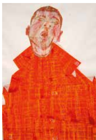
PATRICK CHAMBON Drapé , 2017